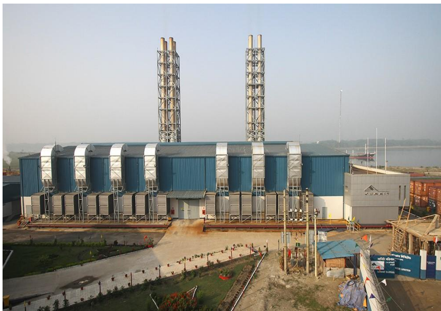
Summit Power Ltd