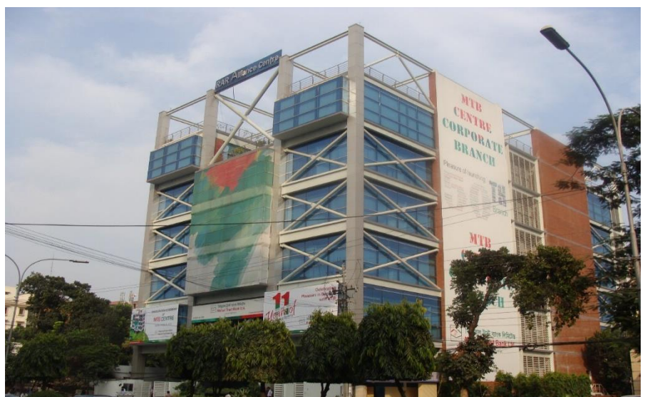
Mutual Trust Bank Ltd