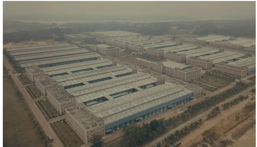
Young One Ltd. (Korea)